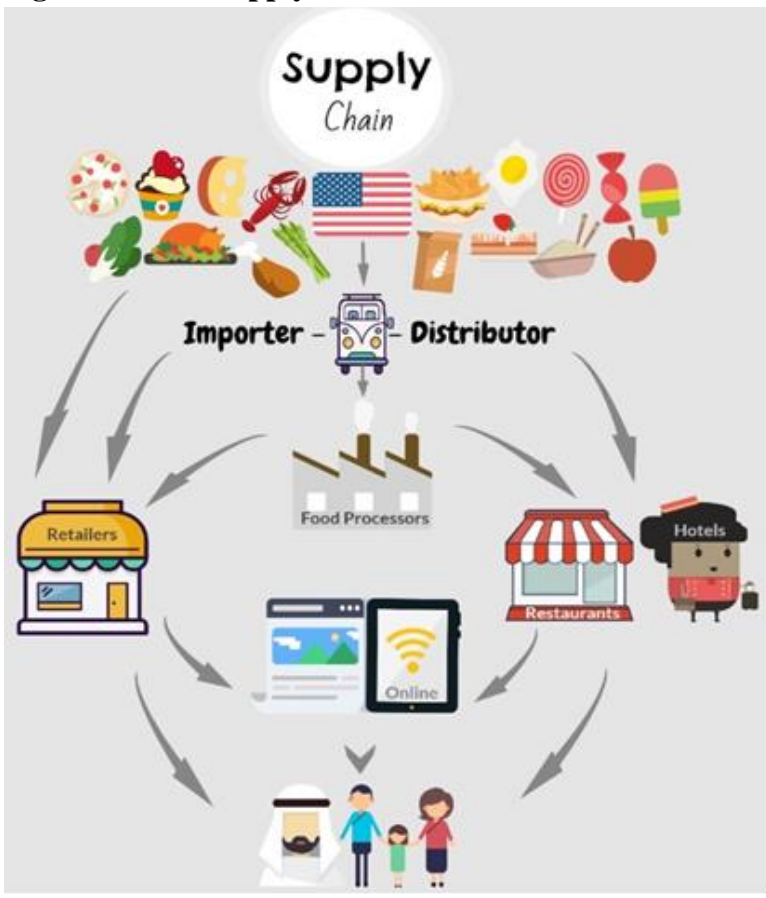
Figure 2: UAE Supply Chain